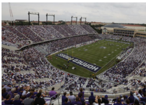
Amon G. Carter Stadium (46,000)