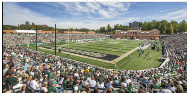
Jerry Richardson Stadium (15,314)