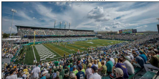
Yulman Stadium (30,000)