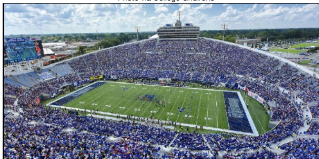
Simmons Bank Liberty Stadium (56,862)