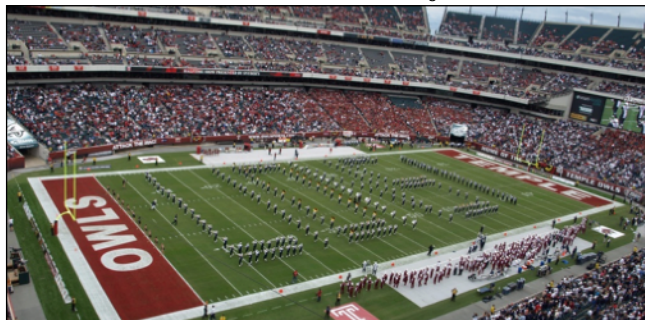
Lincoln Financial Field (69,176)