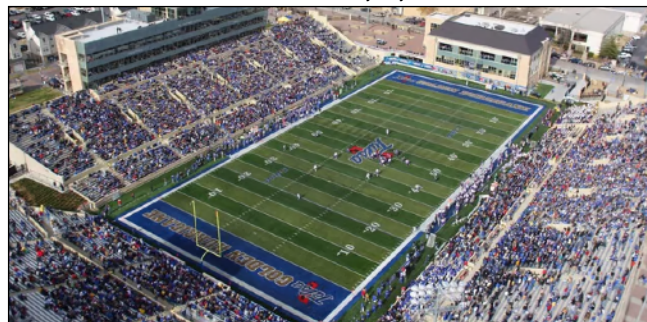
H.A. Chapman Stadium (30,000)