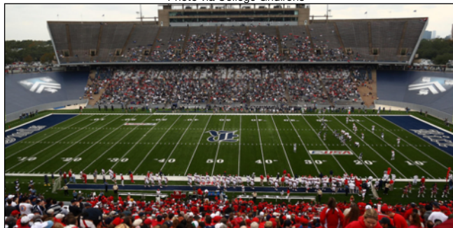
Rice Stadium (47,000)