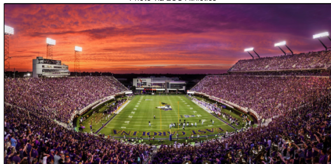
Dowdy-Ficklen Stadium (50,000)